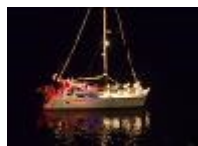
Sailboat 31 Ft. & Over SPIDER CRAB Captained by Greg Buchanan