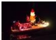
Private 30 Ft. & Under SEA BISQUIT Captained by Ron McNeil